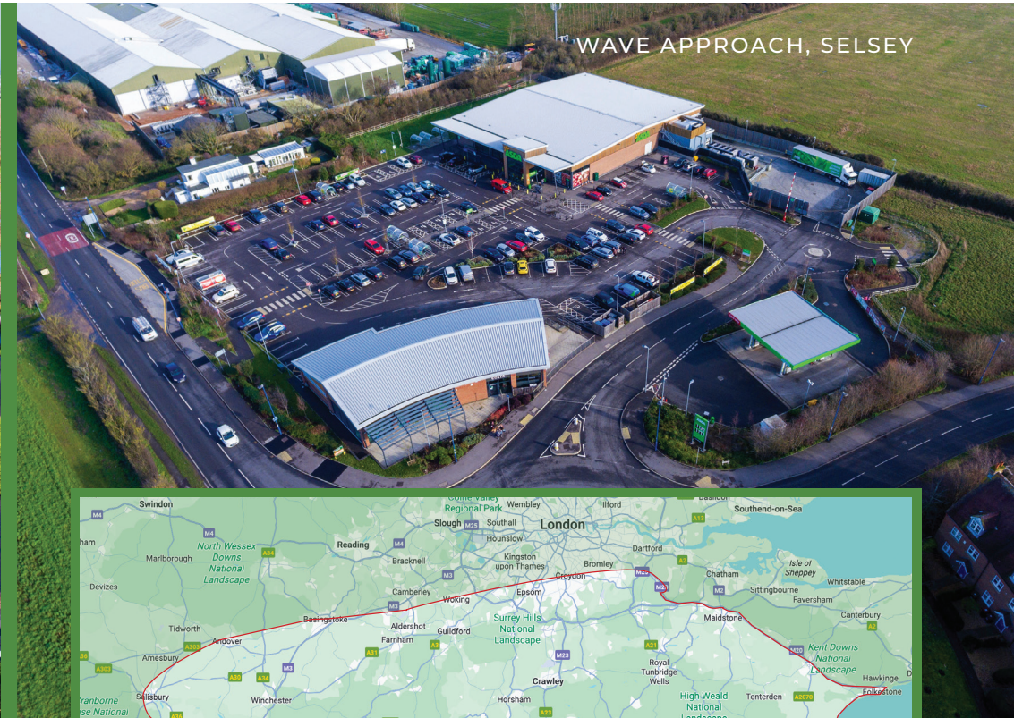
WAVE APPROACH, SELSEY

Supermarket, petrol filling station and small convenience retail.